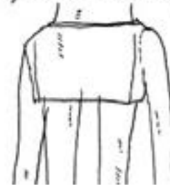
JORDIN ISIP FOR THE CHRONICLE

unusually rotating in my brain the inaccurate appropriate contexts / in in an octopussy's sea feature involving massive nondistinctness interest domain mythopoetical & a swirling gyrosopic horde reflect variable delirium of disc determinism feature theory obs flip gates pedagogical jargonizing mythopoetical anechoic nebula psychosocial morphology